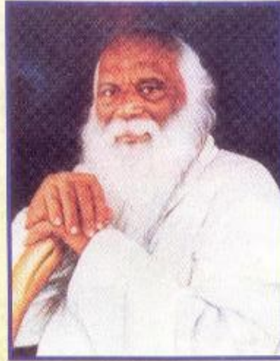
PADMABHUSHAN DR. KARMAVEER BHAURAO PATIL