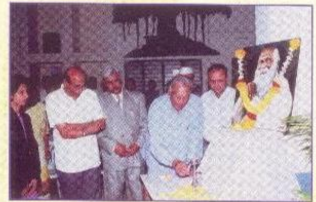
Inauguration of B.B.A. & B.C.A. Courses