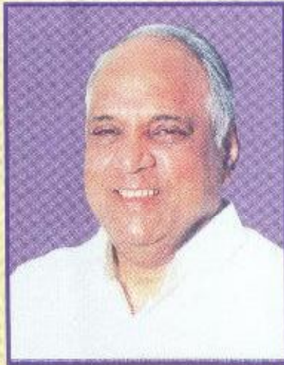
HON. SHARADRAOJI PAWAR PRESIDENT