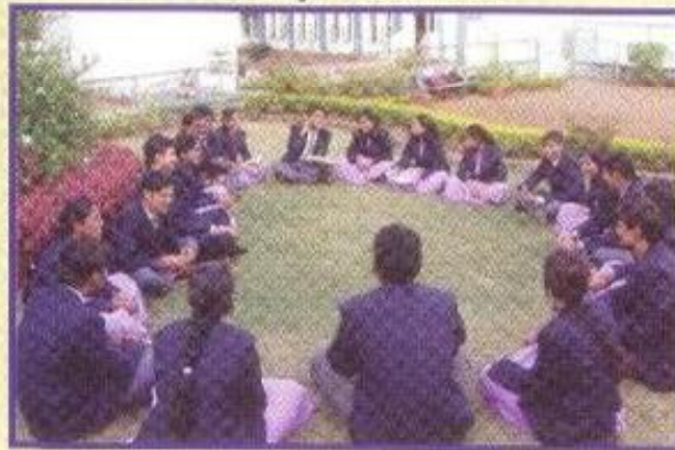
Brain Storming Session